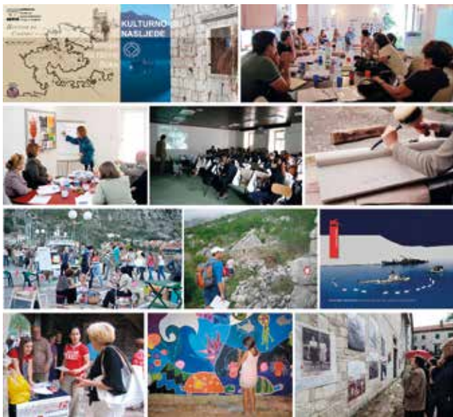
Fig. 5: An illustration of Expeditio's activities.

In conclusion, it can be said that in the Kotor Region there are not many organizations or initiatives dealing solely with World Heritage issues. Although different representatives of the civil sector contribute to World Heritage area protection through different activities, so far, unfortunately, they have not been able to considerably influence the key on-going processes.