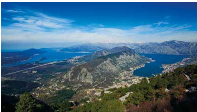
Fig. 2: Boka Kotorska Bay, encompassing the Kotor Region WHS and its Buffer Zone.

The Kotor Region is an expansive and complex property, especially considering its buffer zone, which is currently being brought under great pressure that is threatening its OUV. In 2003, the Kotor Region was removed from the List of World Heritage in Danger since the threats for which it was placed on the list in 1979, i.e. the partial destruction caused by an earthquake, have been reduced through professional restoration. At the same time, other, more serious threats were identified for the first time that year, i.e. the risks that excessive and uncontrolled urbanisation are posing to the OUV of the property. Accelerated urbanization unfortunately still continues on the territory of the protected region and its buffer zone (Fig. 2).