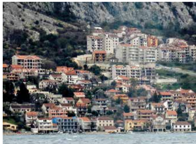
Fig. 4: Due to the steeply ascending terrain, inappropriate construction development has an immediate effect on the visual integrity of the cultural landscape. Settlement of Dobrota.