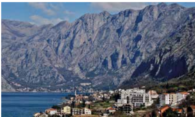
Fig. 3: Due to a dramatic increase in tourism, urban sprawl is taking over ever larger parts of the inner bay. Settlement of Dobrota.

There is also the general attitude of the softening of problems and the WH requirements. Draft decisions made at the 2014 WH Committee Meeting included an article stating: "Halt any building or infrastructure development projects within the property until such time as the necessary planning and management tools have been finalized and put into practice" . 8 However, after discussion on the meeting, and despite the advisory bodies' clear recommendations, this article was re-formulated into: "Encourages controlled implementation of developments in Morinj, Kostanjica and Glavati and requests the State Party to undertake Heritage Impact Assessment to ensure that no impact occurs on Outstanding Universal Value." 9 (Fig. 4).